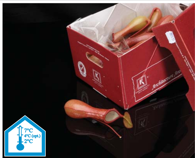
Content: 25 vases in a Koppert box (20x30 cm)