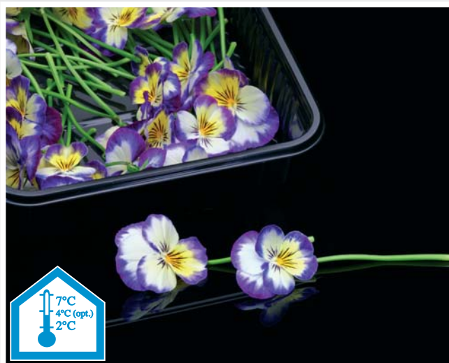
Content: 50 flowers in a cup, 4 cups in box (20x30 cm)